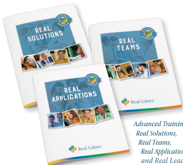
Advanced Training: Real Solutions, Real Teams, Real Applications, and Real Leadership.