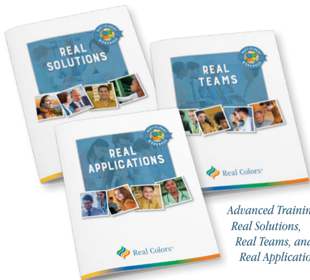
Advanced Training: Real Solutions, Real Teams, and Real Applications.

Using this powerful knowledge, your participants will develop more effective communication skills and build better relationships, in and out of the workplace.