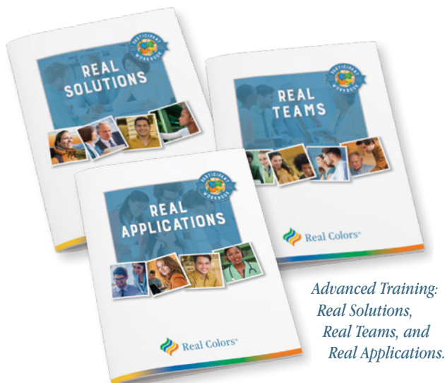
Advanced Training: Real Solutions, Real Teams, and Real Applications.

Using this powerful knowledge, your participants will develop more effective communication skills and build better relationships, in and out of the workplace.