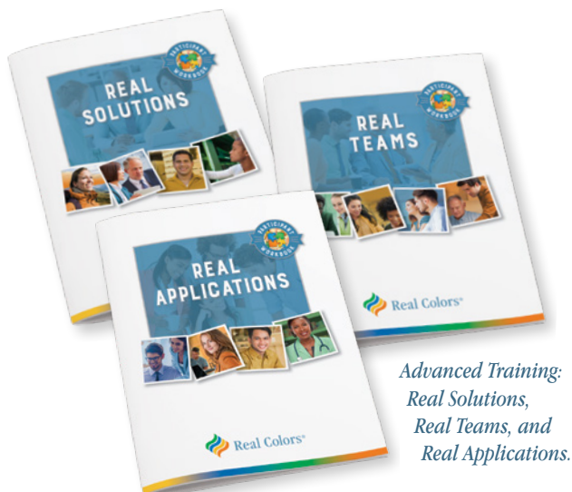
Advanced Training: Real Solutions, Real Teams, and Real Applications.

Using this powerful knowledge, your participants will develop more effective communication skills and build better relationships, in and out of the workplace.