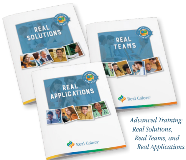
Advanced Training: Real Solutions, Real Teams, and Real Applications.

Using this powerful knowledge, your participants will develop more effective communication skills and build better relationships, in and out of the workplace.